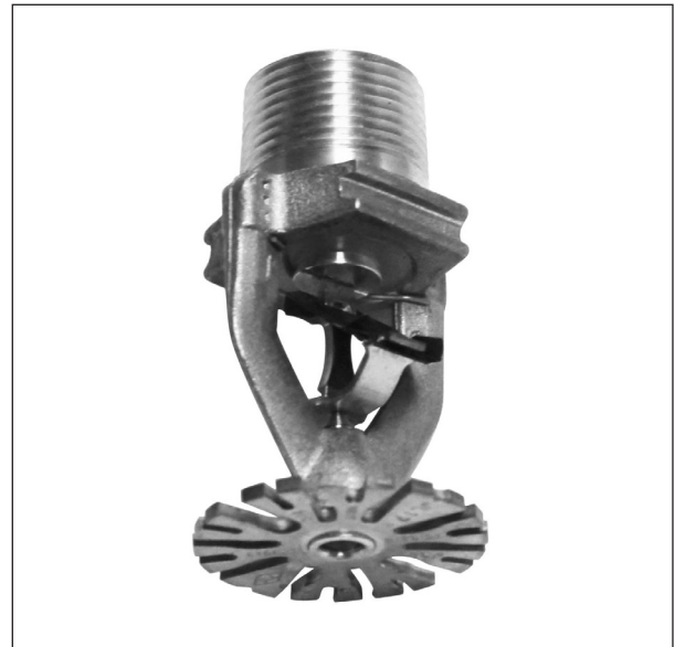
Model JL-17 ESFR Sprinkler

The Model JL-17 ESFR sprinkler was designed to be shorter and more compact than other ESFR sprinklers. The shorter sprinkler allows piping to be installed farther from the ceiling and obstructions. The JL-17 ESFR sprinkler is also less susceptible to damage due to smaller deflector and frame design. The lighter JL-17 ESFR passed rough use and abuse listing tests without plastic protectors.