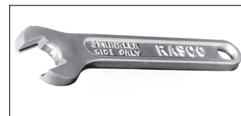
Model J1 Sprinkler Wrench

Use only the Model J1 sprinkler wrench for removal and installation. Any other type of wrench may damage the sprinkler. A grooved wrench boss is provided on the sprinkler to limit the potential for the wrench to slip during installation.