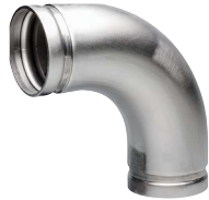
Stainless Steel Publication 17.16