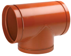
AGS - Advanced Groove System from 14 – 60"/350 – 1500 mm Publication 20.05