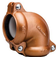
Copper Installation-Ready™ Publication 22.15