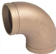
Copper Publication 22.04