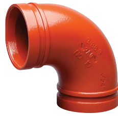
No. 10 Elbow