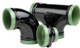
Extra Heavy EndSeal "ES" Publication 07.03