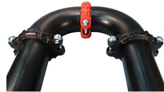
XL fittings for abrasive services Publication 07.07