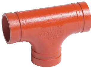
No. 20 Tee