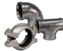
Shouldered Ends Publication 07.06