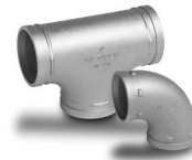
Aluminum Publication 21.03