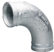
Galvanized Publication 07.01 for Original Groove Fittings Publication 20.05 for AGS Fittings