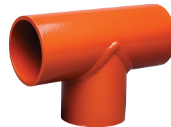
Plain End Publication 14.04