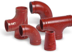
Ductile Iron for AWWA size pipe Publication 23.05